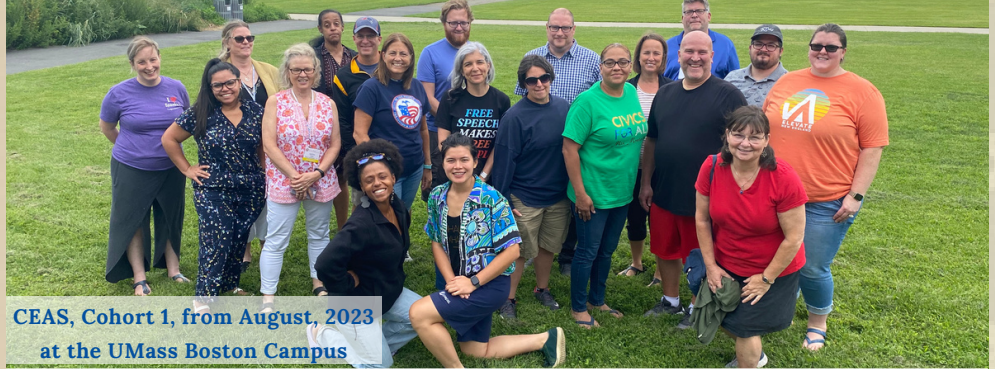
CEAS, Cohort 1, from August, 2023 at the UMass Boston Campus

We The People: Civics that Empowers All Students is a federally funded project of the Center for Civic Education that supports effective educator development through our flagship curricular program: We the People: The Citizen and the Constitution.